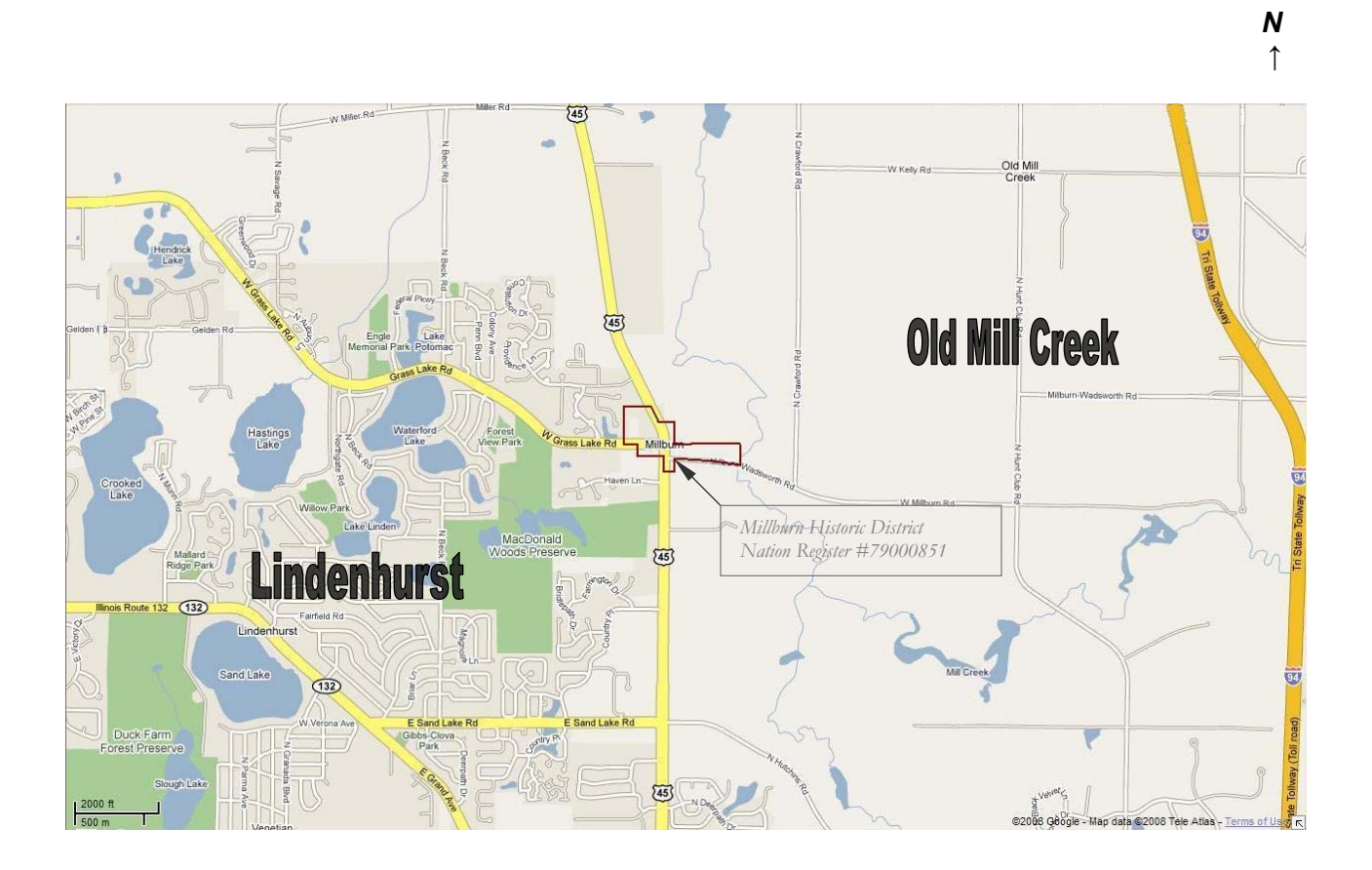
Figure 1-1 Millburn Historic District